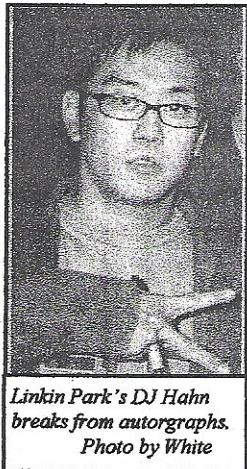
Linkin Park's DJ Hahn breaks from autographs.

Lead vocalist Stephen *continued on page 8